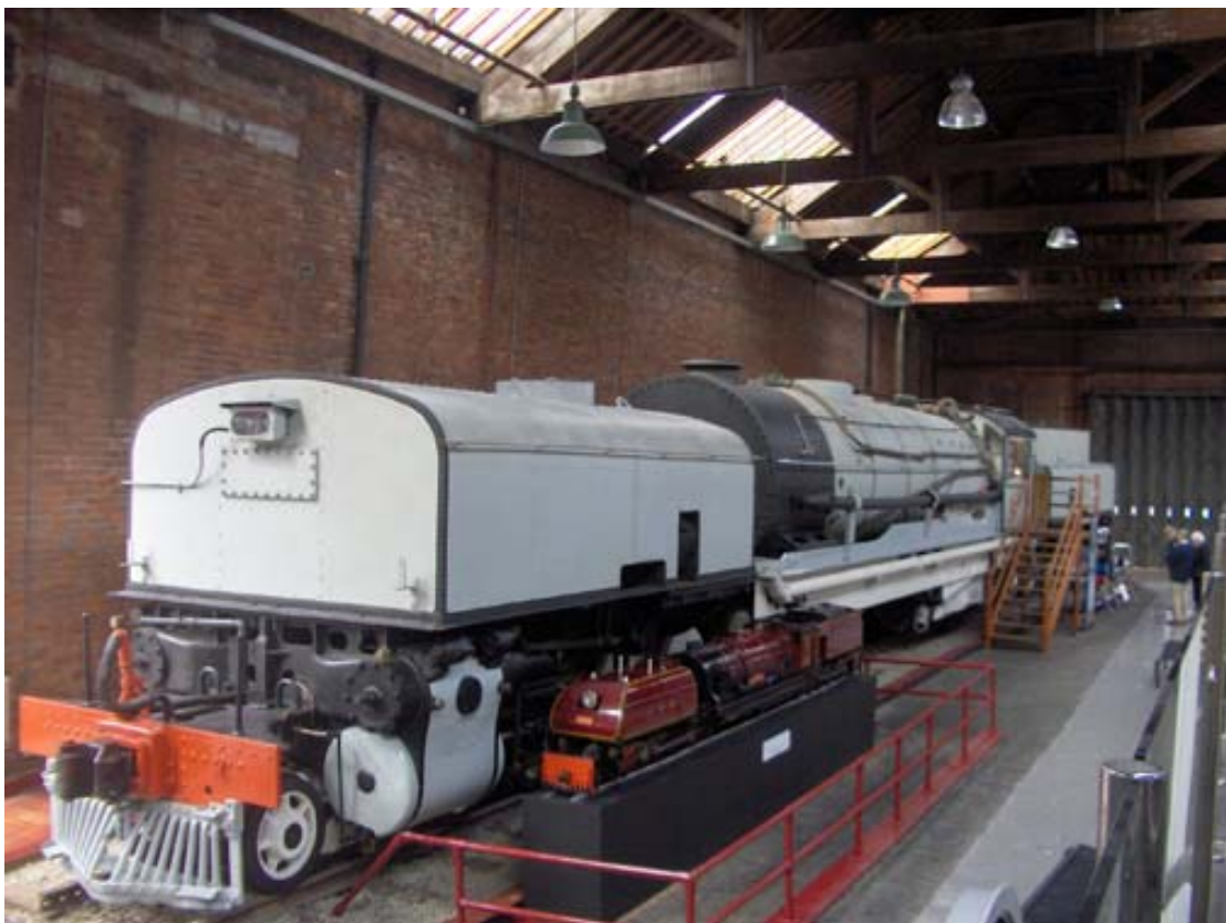
3ft 6inch gauge GL Class Beyer Garratt No 2352 4-8-2 + 2-8-4 works No. 6639 built in 1930