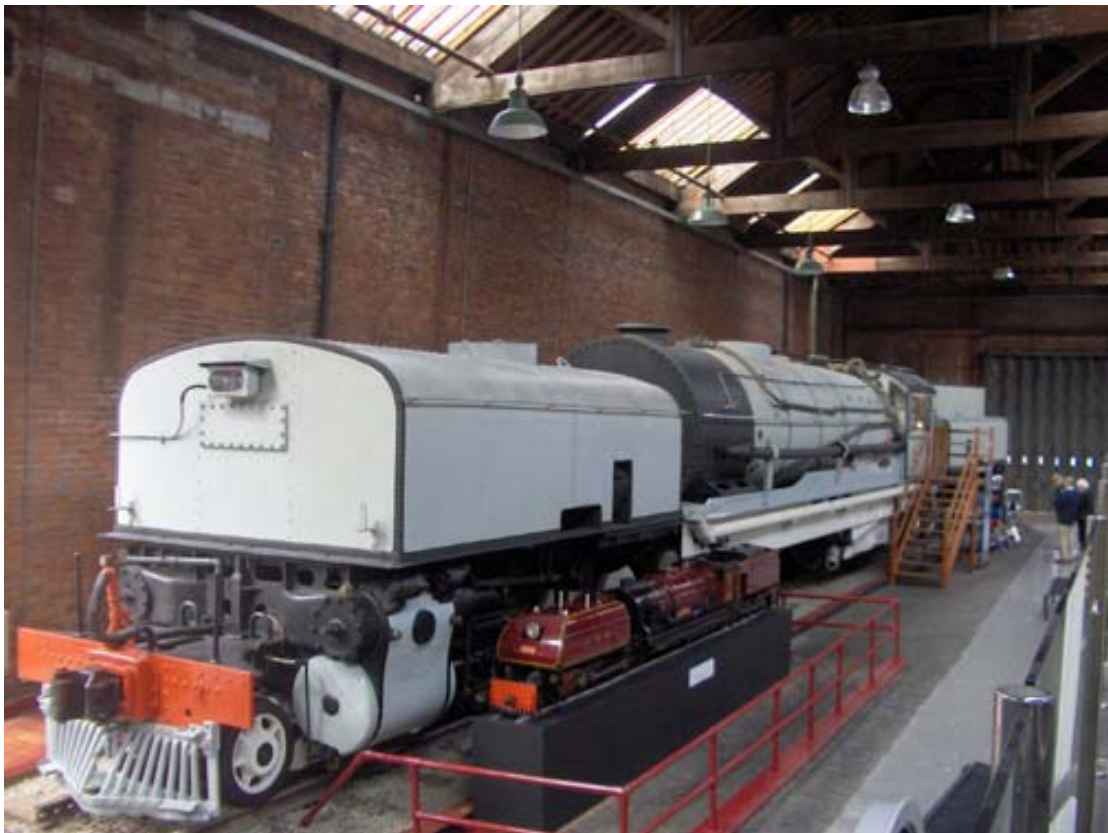
3ft 6inch gauge GL Class Beyer Garratt No 2352 4-8-2 + 2-8-4 works No. 6639 built in 1930