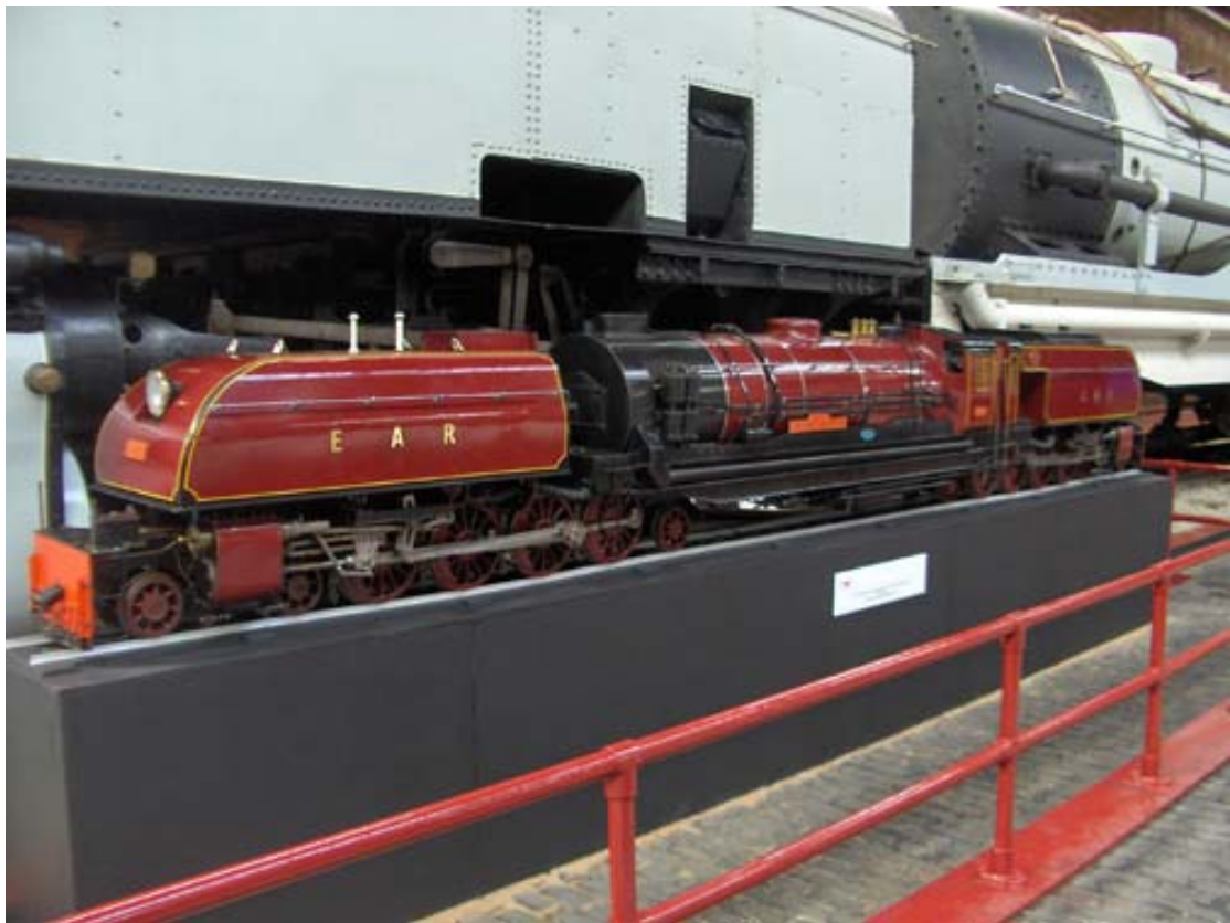
In the shadow of 2352 stands the 7 ¼ inch gauge EAR 4-8-2 + 2-8-4 Class 59 “ Mount Kenya” owned by the National Railway Museum, York.