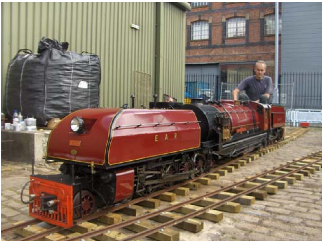
7 ¼ inch gauge “Mount Kilimanjaro” 4-8-2 + 2-8-4 class 59 EAR Beyer Garratt owned by PNP Railways